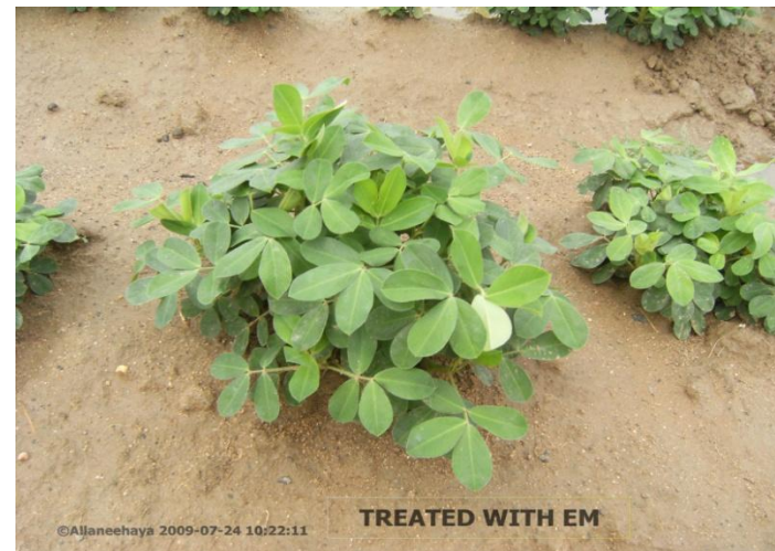
Treated with EM