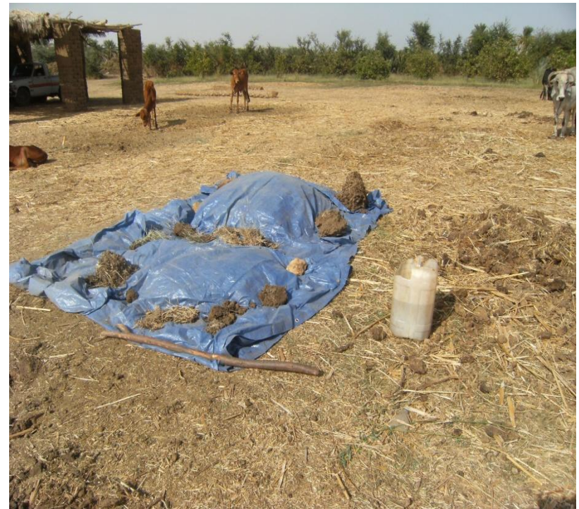
Crop residue left to ferment