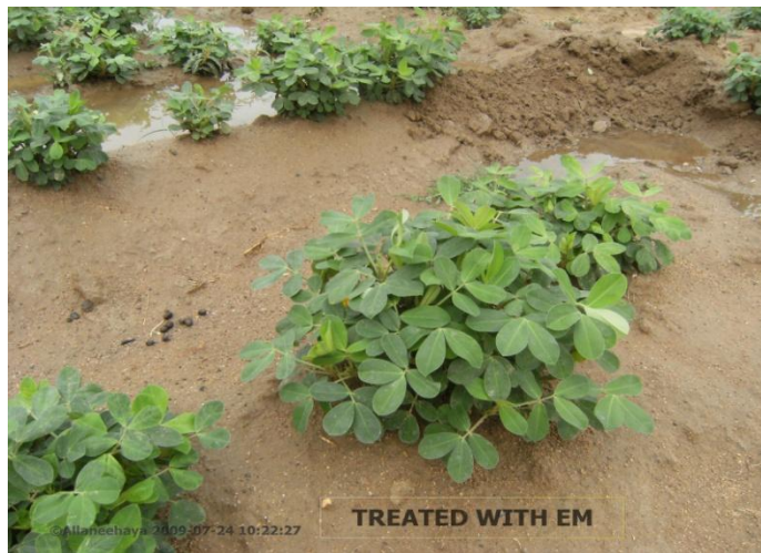
Treated with EM