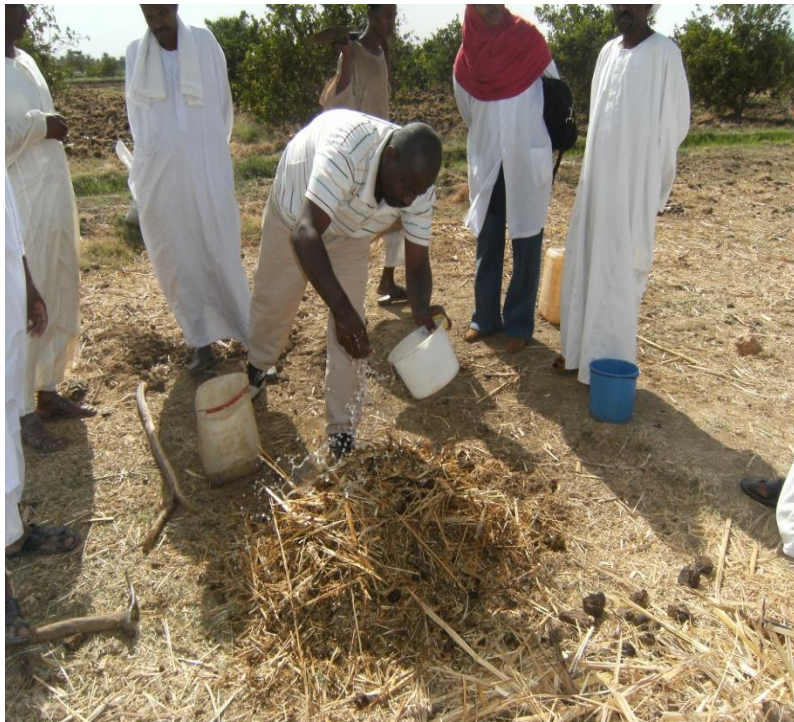
EM solution added to crop residues