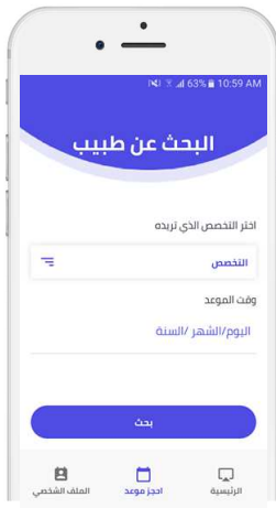
Search Doctors by specialty

Tebfact is a mobile platform that provides instant video/audio/messaging healthcare consultations for Arabs.