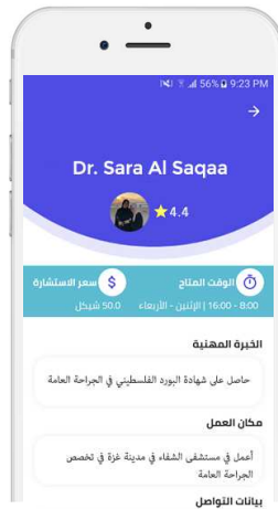
Review doctor's profile