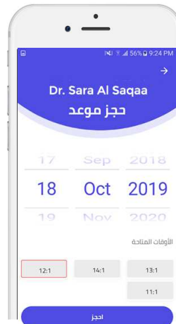
Select suitable time for session