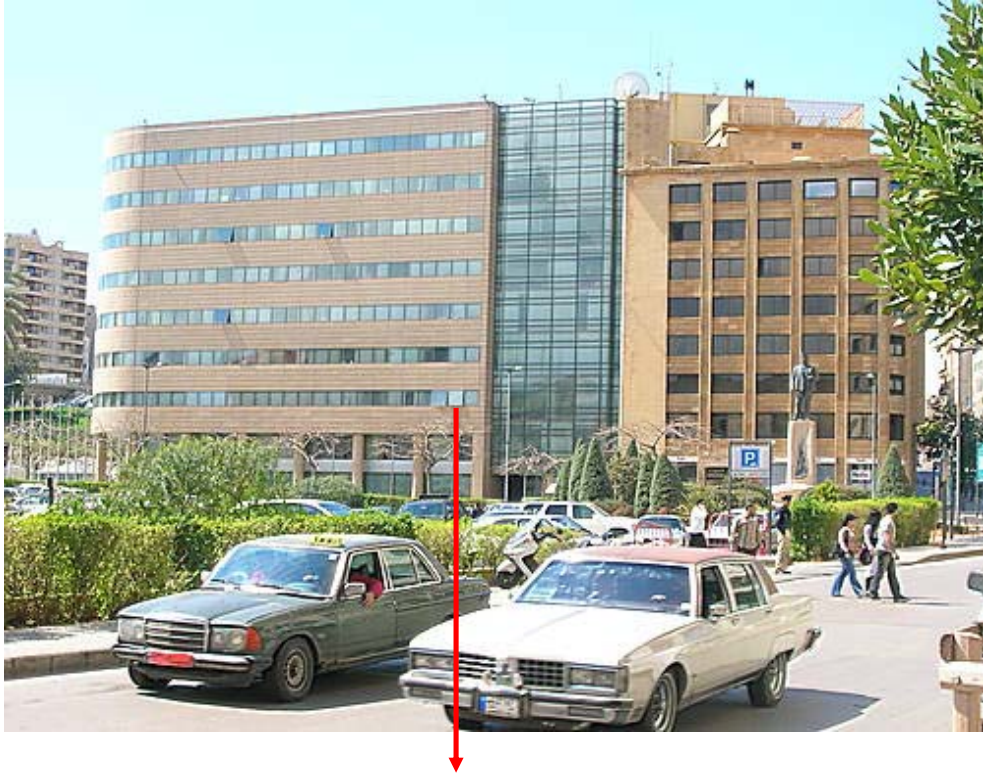
The UN House Building in Riad El Solh, Downtown Beirut