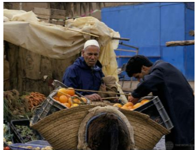
Innovative Approaches for Accelerating Food Systems Transformation WFP's Food Systems Challenge Project in Lebanon, Investing in Private Sector