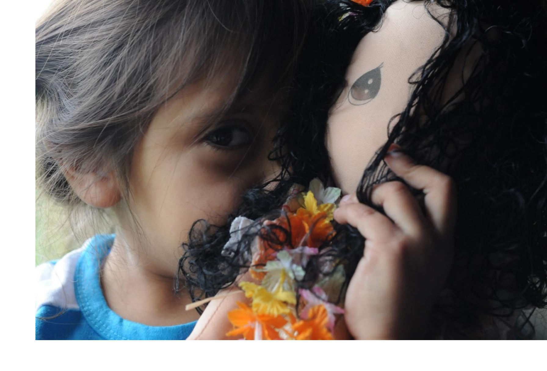
SDG 16.2.3 ON SEXUAL VIOLENCE IN CHILDHOOD