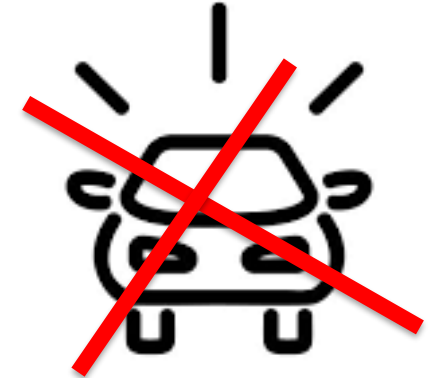
Discourage Private Cars