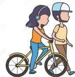
Safe non-motorized modes