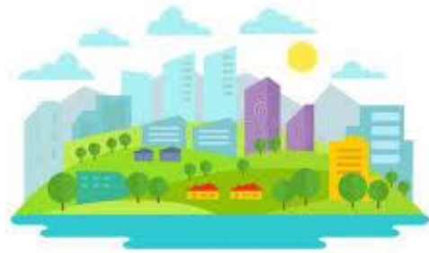
Compact Urban Design