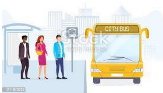
Encourage Public Transport