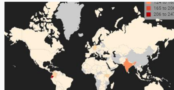
Dashboard showing location of respondents to IDA's second Global Survey on ODP participation

"Accessible Surveys has been crucial to IDA's work in reducing the disability-data gap by reaching individuals with disabilities who were excluded from traditional online survey platforms that solely focused on visual accessibility."