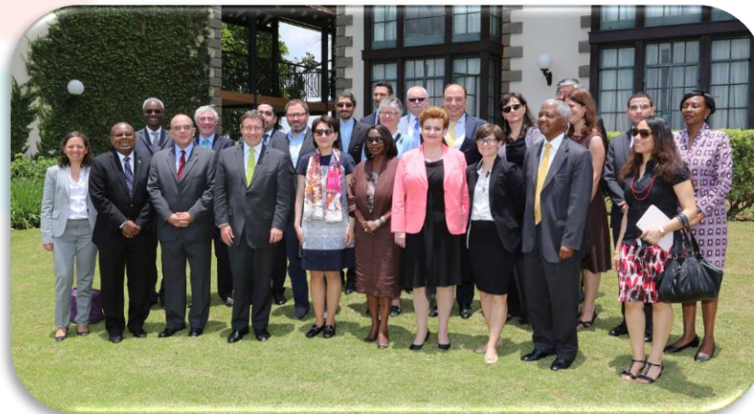
UNEA Bureau meeting in Nairobi (March 2015)